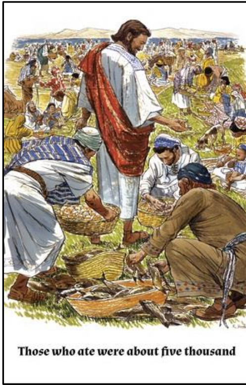
Those who ate were about five thousand